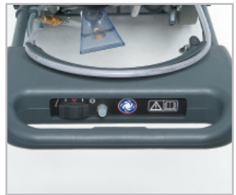
Simple controls make it easy to learn and use.