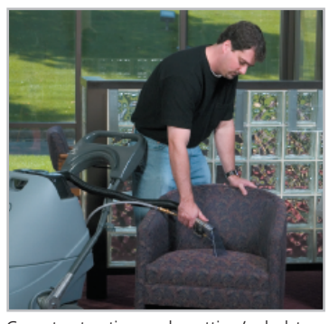
Carpet extraction and spotting/upholstery machine in one with integrated hand tool.