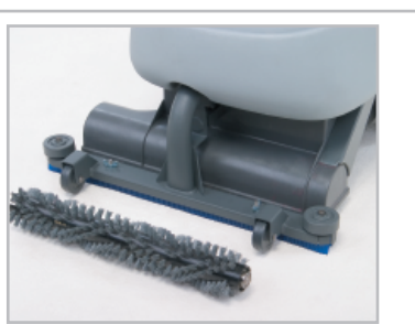
Optional hard floor converts any AquaClean® into a hard floor scrubber.