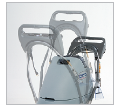
18FLX has dual operating modes for traditional or high productivity walk behind extraction.